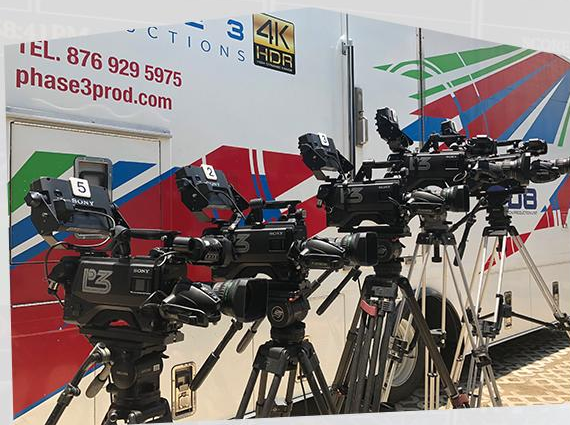
LARGE INVESTMENT IN 4K/HDR 12G TECHNOLOGY