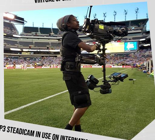
P3 STEADICAM IN USE ON INTERNATIONAL GAME IN THE USA