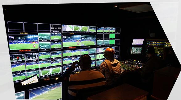
DIRECTING & PRODUCING FOOTBALL IN NEW YORK RED BULL ARENA