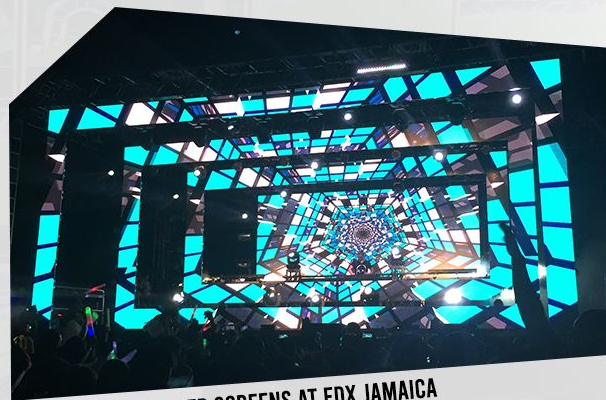
LED SCREENS AT EDX JAMAICA