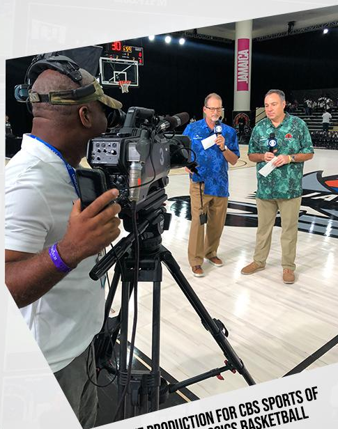
LIVE PRODUCTION FOR CBS SPORTS OF JAMAICA CLASSICS BASKETBALL