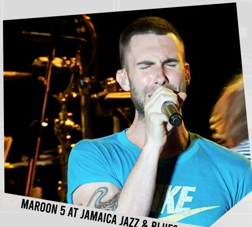
MAROON 5 AT JAMAICA JAZZ & BLUES