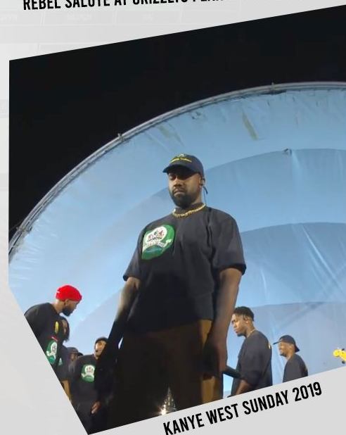
KANYE WEST SUNDAY 2019