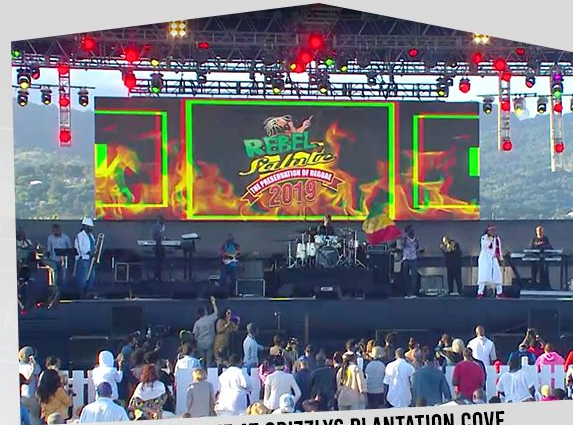
REBEL SALUTE AT GRIZZLYS PLANTATION COVE