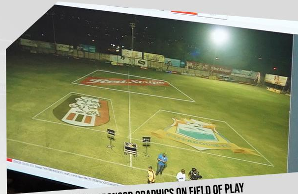
VIRTUAL SPONSOR GRAPHICS ON FIELD OF PLAY